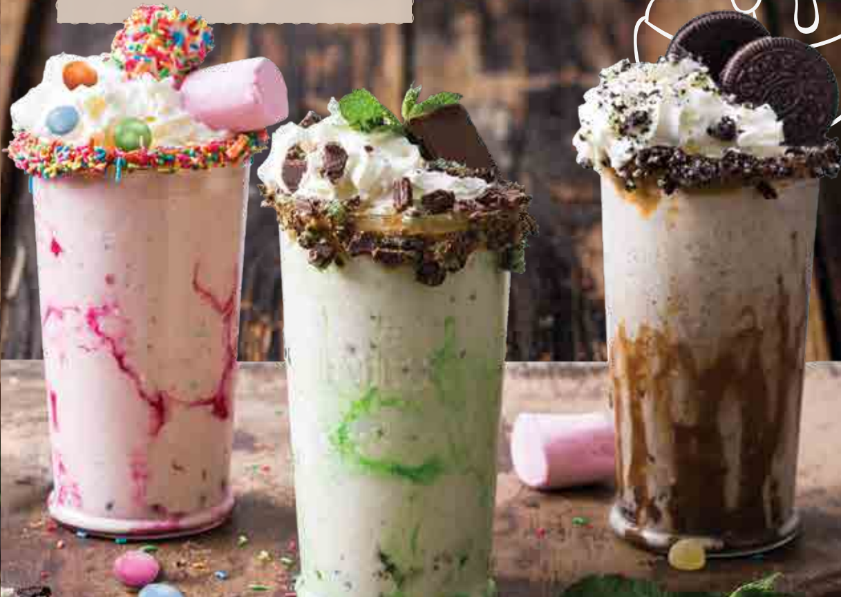
Photographs are representational only.

Double shot Captain Morgan Rum, banana and vanilla ice-cream.